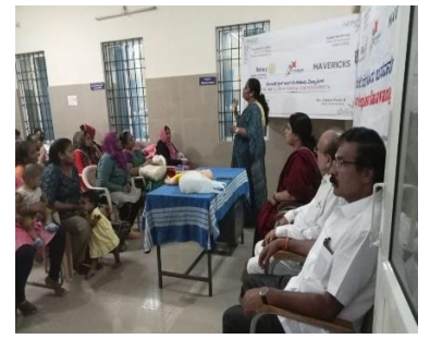
Participation in ICGF "SAMMILANA" at Ramanagara.